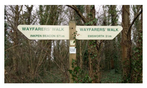
Figure 3 Wayfarers walk signpost

The Conservation Area is now predominantly residential although its history with the now demolished mill relates to a more commercial past. The coastal setting of the Conservation Area makes it a prime location in which to live and also a popular destination for leisure activities. Popular pursuits include walking, cycling, rowing or sailing.