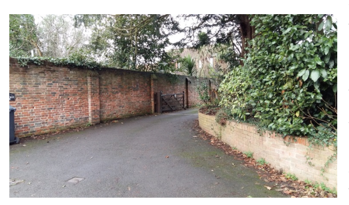
Figure 7 Boundary walls to Tulip House

Walls, hedgerows and low timber fences provide a strong definition of property boundaries throughout the conservation area. Walls of particular note are those that would have formed the original boundary of Flint House to the north and west. Both walls are constructed of red brick and are fairly high. The north wall delineates the northern boundary of the conservation area from the open field. This has a strong visual presence in views from Langstone Road separating the different character of these land uses.