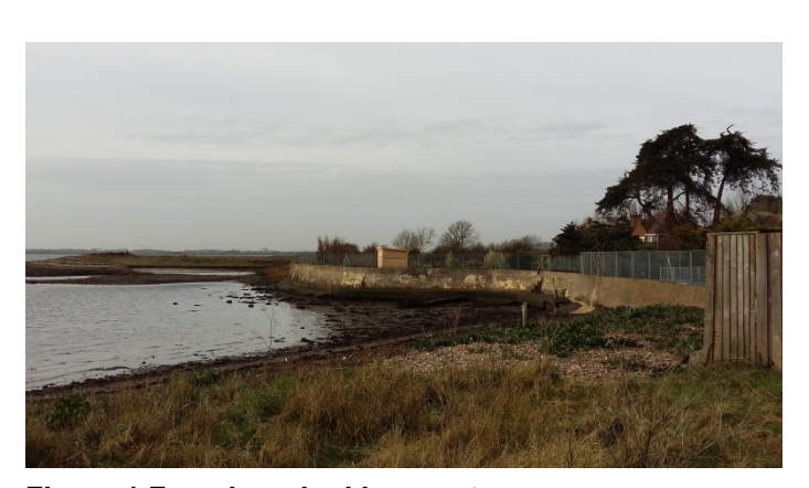
Figure 1 Foreshore looking west

The southern portion of the conservation area has a unique coastal setting, with the harbour and its wetlands having national and international significance for their environmental and nature conservation interest. This is recognised through a number of designations, including the International Wetlands (RAMSAR) convention, European designated Special Area for Conservation (SAC) and Special Protection Area, and nationally designated Site of Specific Scientific Interest (SSSI).