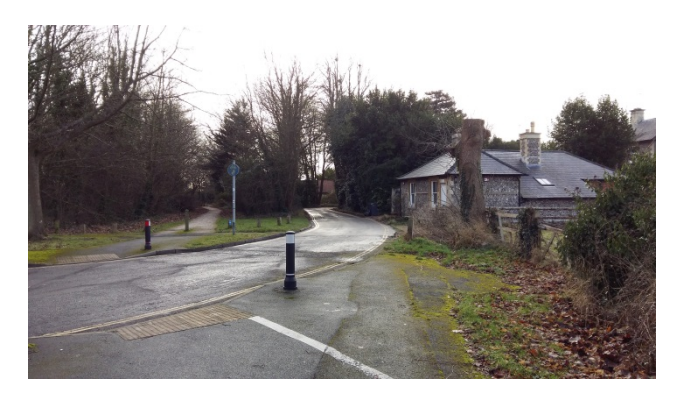
Figure 2 Junction of Mill Lane and Langstone Road (A3023)

The conservation area is well defined by the immediately adjacent Hayling Billy Trail to the east, the Lavant Stream to the west, fields/meadow to the north and harbour to the south forming distinct physical boundaries.