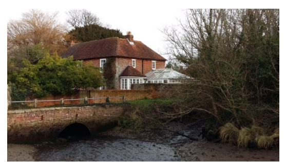
Figure 6 West Mill (formally known as Langstone Mill)

are usually orientated with the ridge running parallel to the road, and many are set back from the front boundary.